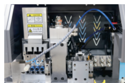
桥位高低自动调节 Bridge Height Adjustable