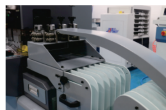
七组线盘 Multi Rule Cassette