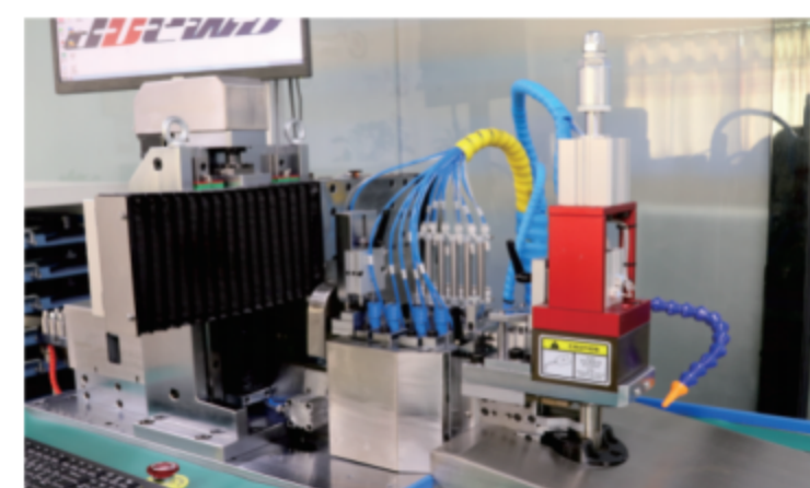
全新打点磨圆 Multi Nicking&Grinding