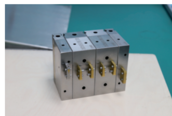
多功能冲切模 Multi Functions Punch Tool